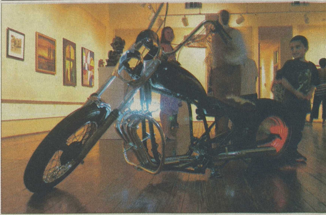
Tony Tyler's One Man Show at The Live Oak Art Center in Columbus will be on display until November 2. The show opened last weekend. Pictured above is one of Tyler's many unique works.